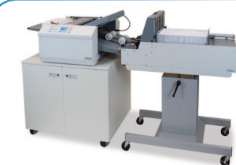
FD 2054 in-line with optional V-Stack36 Vertical Stacker, stand and cabinet