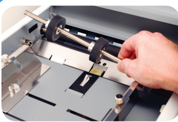
Removable Feed Wheels