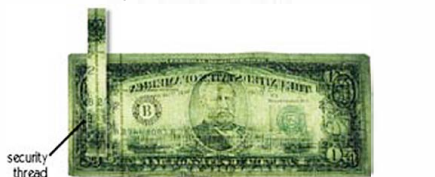
Figure D - Series 1990 through 1995