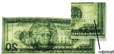
Figure C - Series 1996 and later